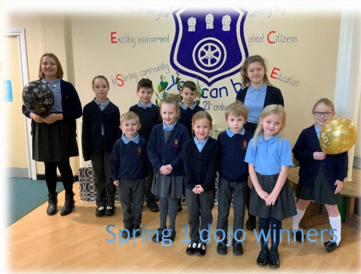
Spring 1 dojo winners